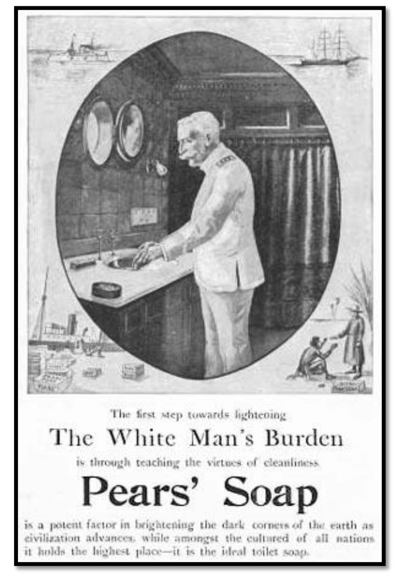
Figure 11: Advertisements like this one expressed an American colonial view that it was their righteous duty to "civilize" the Philippines natives, and teach them American values, like the virtues of cleanliness. Photo from:

Take up the White Man's burden-Send forth the best ye breed-Go bind your sons to exile To serve your captives' need; To wait in heavy harness, On fluttered folk and wild-Your new-caught, sullen peoples, Half-devil and half-child... (Kipling, 1899)