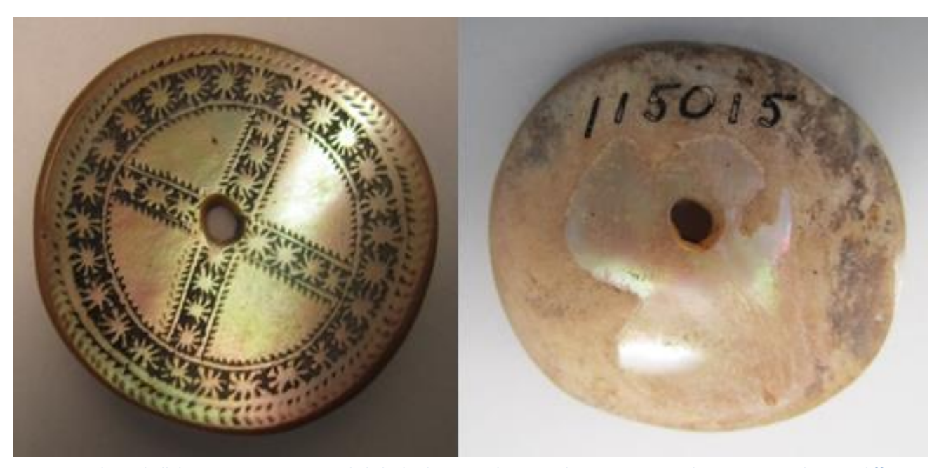
Figure 14: These shell disc earrings were worn daily by both men and women, however, men and women wore them on different parts of their ears.

This earring, called kalēpān by the Ilongot, is roughly circular with a diameter of about 3.5 cm and made of shell (Field Museum Catalog Card #115015). Presumably, it was once part of a pair. The disk is curved with a 0.5 cm hole drilled just of center. This hole, like those drilled in the other objects, was likely made using a bow or pump drill (Villeges 1983; 24). The catalog number (#115015) was written on the back of the object with a black marker. The shell is iridescent on the front side and ornamented with a blackened, incised pattern while the reverse is matte.