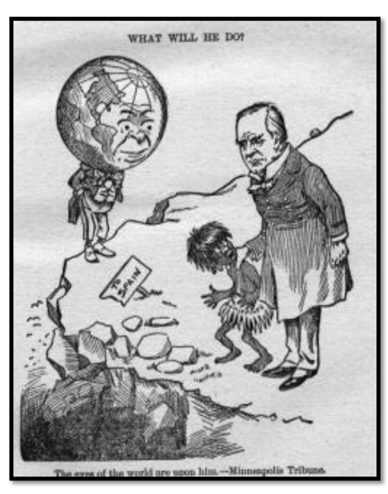
Figure 10: Public opinion did not favor the imperialistic motives behind American annexation of the Philippines, but expressed a feeling of moral obligation to save the people of the Philippines, both from Spain and their own perceived savagery, with the eyes of the world upon them.

War had weakened Spain's influence. The revolution resulted in a brief period of Philippine independence in 1898. At the end of the war, however, Spain and the