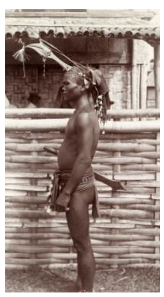
Figure 5: Mature, skilled headhunters wore headdresses created using the beaks of red hornbills and lightweight wood that symbolically expressed their power and connected them to spirit birds.

Rosaldo (1986) compared the relationship between beheader and victim to that of lovers whose courtship lasted the entirety of the headhunting raid. The night before a raid, the hunters sang in high-pitched tones to call the amet to fly through the trees to attend the ceremony. The imagery of flight and piercing shrieks symbolically linked the amet with the red hornbill, which was often symbolically associated with headhunting in important ways (R Rosaldo, 1986, p. 312-314). Red hornbills were understood to act as spirit birds, guiding and protecting the hunters as well as their amet. In addition to batling earrings, skilled headhunters often wore elaborate headdresses featuring the entire beak and crest of a red hornbill (See Object #115218)(See Figure 5, Figure 17). These headdresses both strikingly displayed skill in headhunting and symbolized a connection to the protective power of the red hornbill. The hornbill ornaments that initiated men wore to these ceremonies embodied the soul of the spirit-bird and procured future magical protection from the forest deities and curses (R Rosaldo, 1986, p. 312-314). The likening of the cry of the hornbill and the screams of victims as they receive their deathblows displayed further hornbill imagery (R Rosaldo, 1986, p. 312-314). The consent of the victim's amet ,