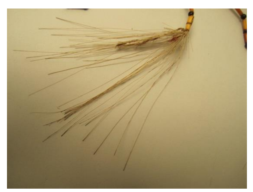
Figure 16: Upon researching objects like this one, it seems apparent that the embellishments at the ends of certain strands are made of horsehair.

The beading on the object follows a loosely repeating pattern of a bamboo bead, followed by a black seed. Each strand hung to roughly the same length on the wearer's body; roughly 22 cm from the base of the neck-form, 50 cm from the top. One strand of the clusters furthest back on either side of the object is much shorter, hanging 18 cm from the top of the neck form. In four of the bundles, and likely all of them at some point, one strand of the bundle ends in an 8cm horsehair