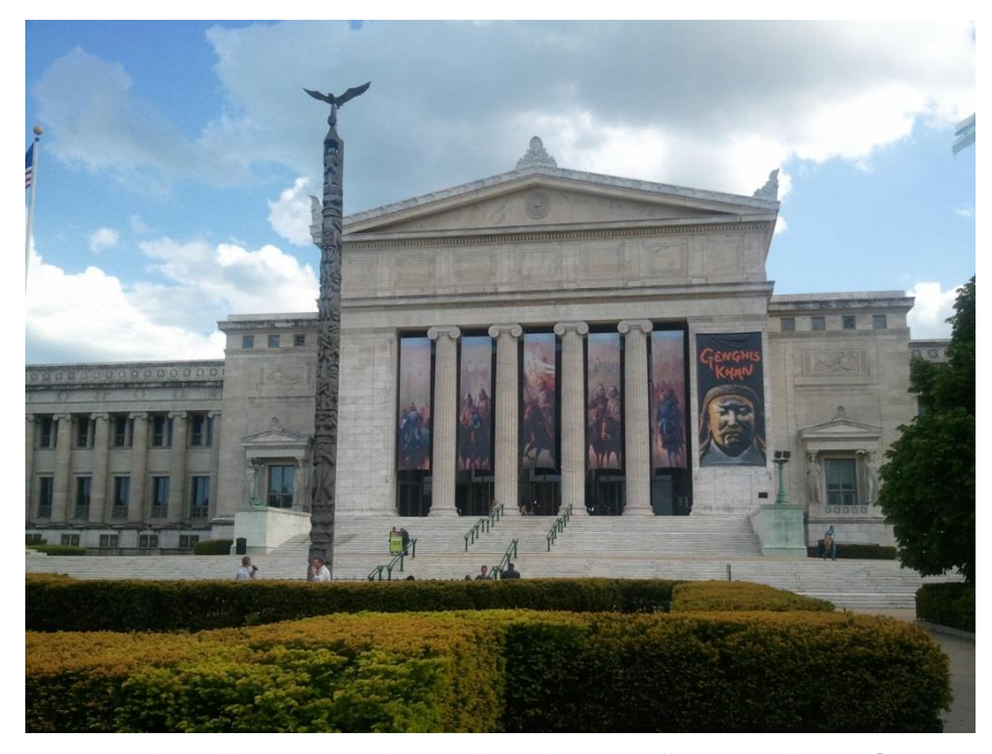
Figure 20: The Field Museum in Chicago, Illinois houses well over a million artifacts, only about 1% of which is on display. The rest are preserved in behind-the-scenes objects. Their collections, collection collections, where conservation efforts protect them for future study.

policies, and exhibitions policies create value and significance, informed by cultural and ideological assumptions (Pearce, 1993, p. 239). The relationships between members of the producing culture, the collector, the museum, and the museum visitor determine the effectiveness with which such meanings can be communicated.