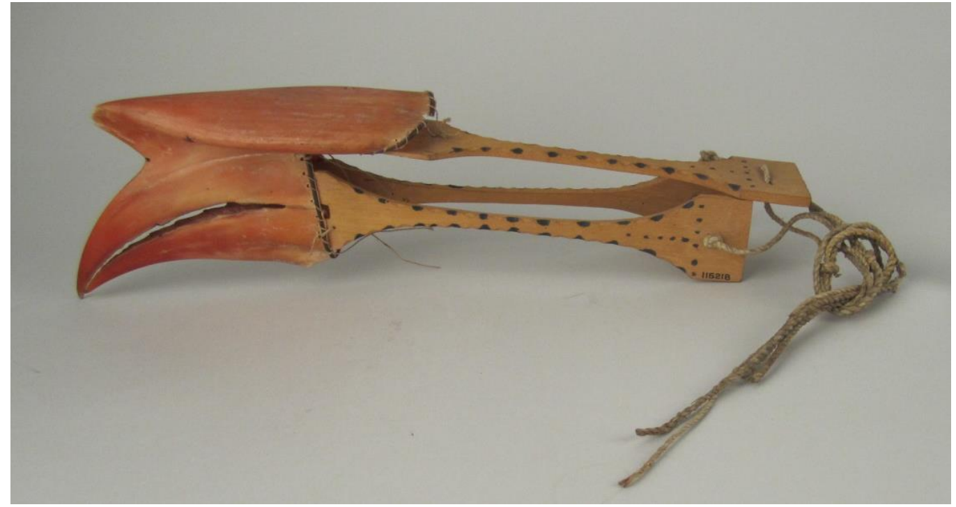
Figure 17: Headhunting ornaments, like this red hornbill headdress were the only llongot ornaments worn only by men, but they were not concealed or hidden from female view.

The red hornbill headhunters' headdress, panglao or toc-bed , was among the most famous of Ilongot personal adornment objects (See Figure 17)(Field Museum Catalog Card #115218). Its frame was constructed of three pieces of narrow wood, two forming the sides and one forming the top, which was secured by woven cordage passed through the wood. The two side pieces line up beside each other and support the beak of the bill and are roughly 27 cm long. A fork shape was cut into the front of both pieces of wood to mimic the shape of the bird's mouth. Behind the bill, both pieces of wood were carved more narrowly from 4 cm to about 1 cm wide then widen again at the rear of the ornament, curving to facilitate placement on the wearer's head. Small pieces of the outside edges were whittled away to create a scallop design, with irregular black circles in roughly every other scallop depression.