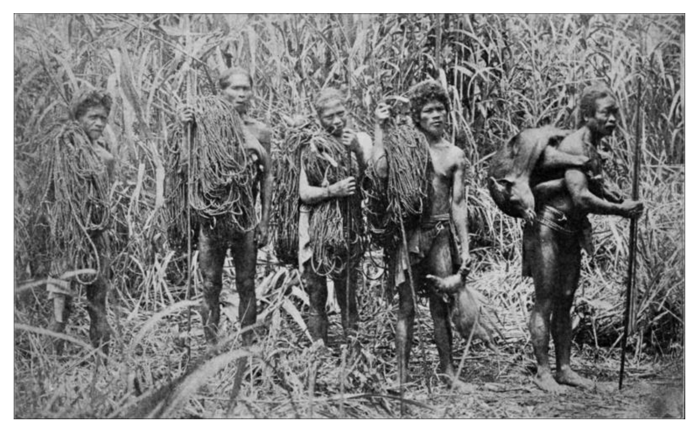
Figure 3: Hunting raids were group endeavors that often lasted days in grueling conditions persevered in extreme stealth.

soul did not consent to decapitation by appearing at this ritual, hunters could not find the victim, and therefore could not behead the victim (R Rosaldo, 1986, p. 310-315; M Rosaldo, 1980, p. 56). If an amet appeared and omen birds gave favorable signs for the safety of the hunters, they departed for the raid the next morning (R Rosaldo, 1980, p. 156-164)(See Figure 3). Several women accompanied them to lend inspirational beauty to the proceedings, and provide a supply of rice to sustain the men on their journey (R Rosaldo, 1980, p. 156-164). Some distance from the victims' village, so their cooking fires would not betray the hunters' position, the women set up camp and prepared food while the men fished. After a large feast, the women gave betel quids—betel leaves or areca nuts with powdered lime and sometimes tobacco that acted as a mild stimulant when chewed—to their husbands, fathers, brothers, and lovers and then departed (Field Museum Catalog Information, Accession #1096; R Rosaldo, 1980, p. 156-164). The men often traveled a great distance further to reach enemy territory, where they camped in the forests and practiced extreme stealth to avoid detection. The hunters dressed to distinguish themselves from their victims by wearing G-string loincloths with white kerchiefs in their hair and lay in wait for an