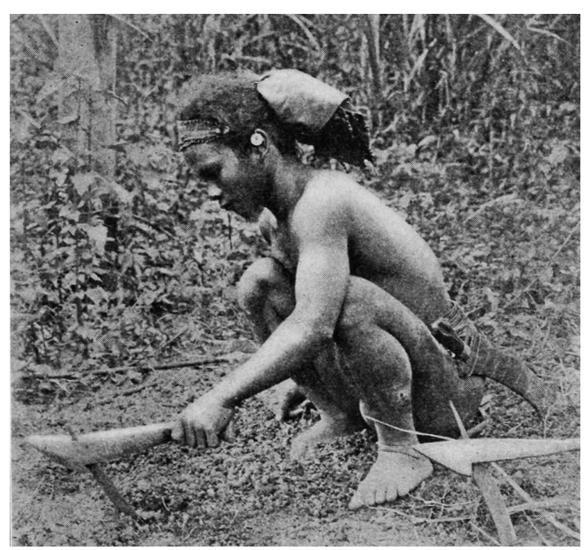
Figure 8: This Ilongot man wore his shell kalēpān from his helixes, in daily activities like ground clearing for rice production.

Communication: Renato Rosaldo). Items of adornment, such as kalēpān (See Object #115015)(See Figure 8, Figure 14), disc-shaped shell earrings with incised designs, represented one type of item that might have been included in bridewealth payments (Field Museum Catalog Information: Accession Number 1096). This provision of goods not only compensated the gift of a daughter, but also displayed the groom's capacity to care for her. Ornaments demonstrated this ability especially well, as only those who could produce a surplus of subsistence goods could