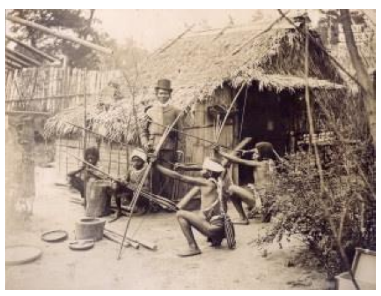
Figure 12: Inhabitants of the Negrito village were expected to demonstrate their "nativeness" at all times to appeal to visitors' attraction to the "Other" but contact with American culture and education drastically colored this façade. Photo from Parezo, 2004, p. 36

The Negritos are the lowest grade of human creatures under the jurisdiction of the President of the United States. They are debased in morals, more feeble in intellect than the Digger Indians of California, yet they are very interesting in many respects, and the intelligence of the children particularly offers encouragement to those who would lift them out of their degradation (Parezo, 2004, p 35-36).