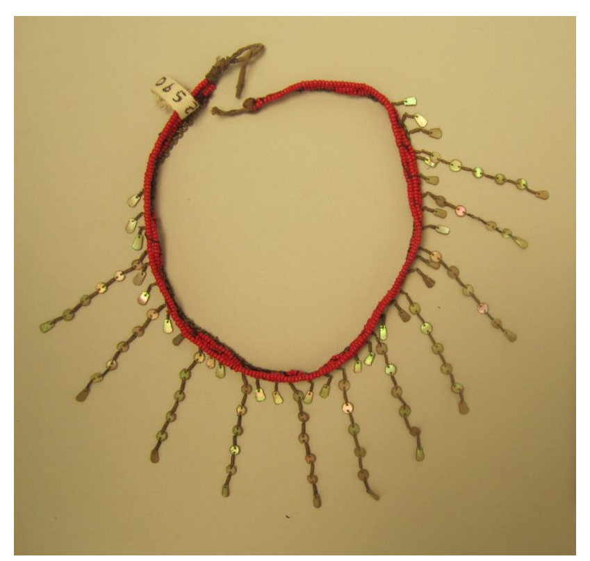
Figure 18: This red beaded necklace has shell pendants connected with brass linkages, and might represent materials from three locations, visibly referencing as many trading alliances.

small size (Casal, 1981, p. 249). Object #242590 measures roughly 38 cm in circumference when worn, which requires a relatively small neck. It is made of red glass seed beads, shell ornamentations, brass findings, black thread, cordage, and red cotton.