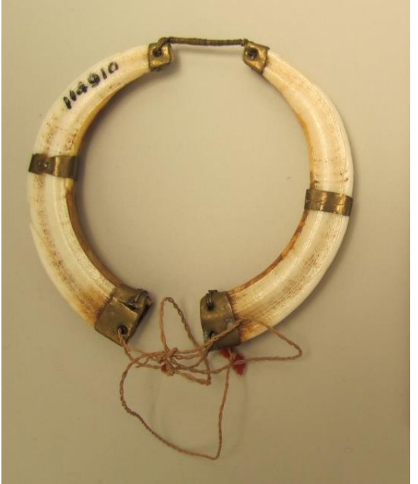
Figure 13: Ilongot people probably wore this boar's tusk armlet at ceremonies, on social visits, on headhunting raids, and as a part of daily ornamentation.

Ilongot craftsmen constructed this armlet using boar's tusks, and brass and cordage findings (See Figure 13). Three flat brass pieces wrap around each boar's tusks at either end and in the center, and are attached to the tusks with brass wire. The narrow ends of the tusks are connected by brass wire, and the wider ends with woven cordage ornamented with red cotton. One end of the cordage has a considerably smaller tuft of red cotton than the other, from which it can be inferred that part of the cotton has probably sustained some damage. When the object was constructed, the cordage would have been easy to untie, allowing the wearer to fasten the ornament to the arm. Now, however, the cordage is brittle. The artist incised the outside edges of one tusk with parallel rows of blackened circles. There are twenty-four such circles on the top row, and twenty-one on the bottom row. Both tusks are hollow and