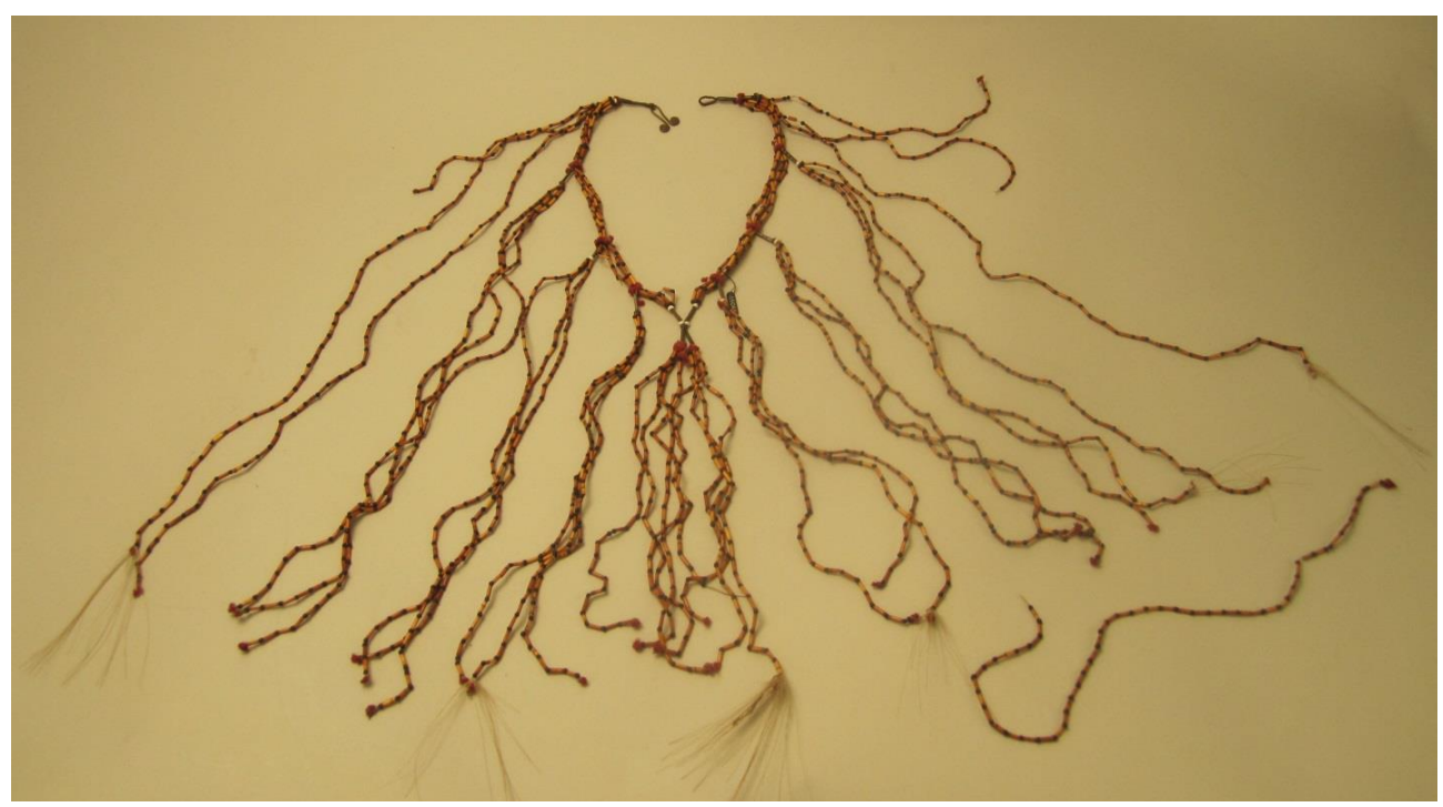
Figure 15: Neck and waist ornaments like this objects lent beauty and energy to ceremonial proceedings.