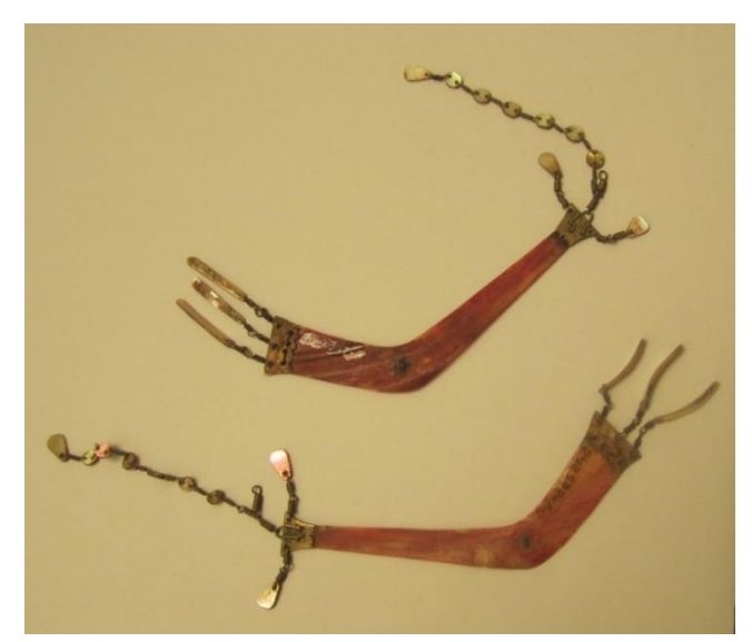
Figure 19: Red hornbill earrings were among the most important ornaments an Ilongot man acquired in his life. They displayed him as a mature adult and a lethal headhunter.

Earrings like these are among the most important ornaments that Ilongot people wore. Supreme