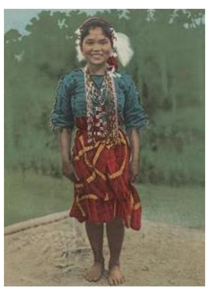
Figure 6: Ilongot persons wore multi-stranded necklaces, like the one worn by this young girl, to ceremonies and special occasions to demonstrate formality and personal success and to embody ceremonial energy.