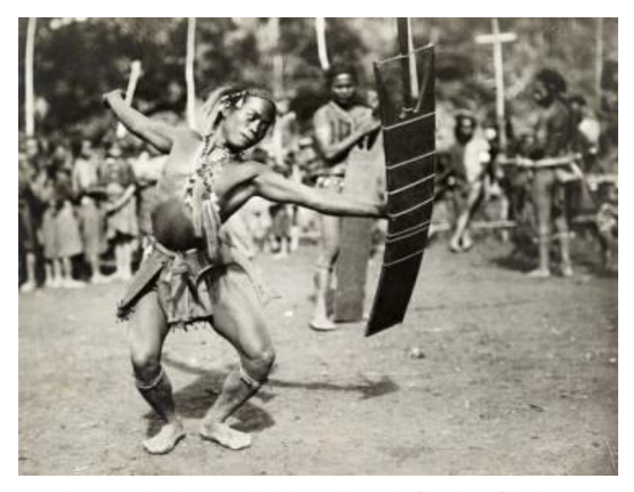
Figure 7: Ilongot persons danced at ceremonies like the buayat celebrations that followed successful headhunting raids and wore elaborate ornaments that embodied quickness and movement of skilled hunters.

with the display and celebration of accomplishment—a name that is bruited widely and aura that creates new liget and makes more men want to kill" (M Rosaldo, 1980, p. 56).