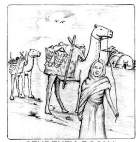
|LA SOCO AF SOOMAALIGA